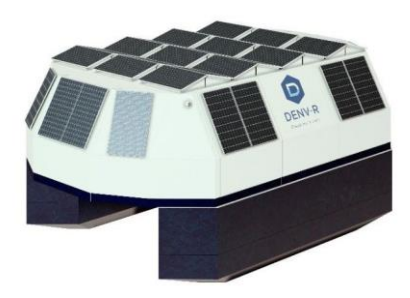
The data center designed by DENV-R will be installed in the River Loire, near the Quai Wilson facility, in the coming weeks.

Designed by DENV-R, the first prototype floating data center will be commissioned in the first quarter of 2024 in the port and maritime area, near the Quai Wilson facility in Nantes. The initial preparatory work was carried out at the end of 2023. The floats are due to be installed in late January. A natural, closed-