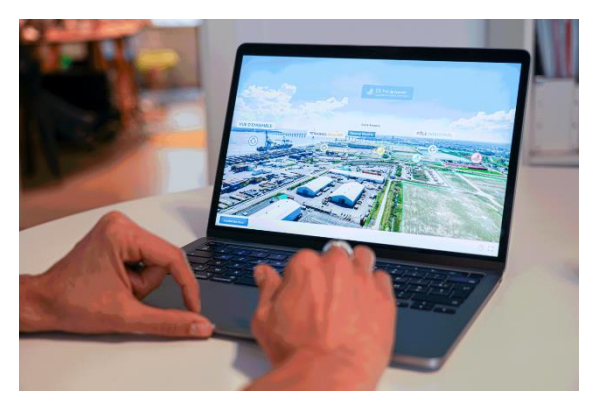
The commercial showcase for real-estate offers, a most valuable asset for the sales teams...

Nantes – Saint Nazaire Port launched a Smart Port initiative in order to facilitate and to speed up digital technology innovations for the benefit of port-based activities and to enhance the attractiveness of the Regional Community. From Season 2 of the Smart Port Hackathon, Nantes – Saint Nazaire Port has derived some genuine, concrete solutions that are going to contribute to its innovative thinking and appeal in crucial areas. The first deliverables from this event, which is now integral to the Loire Estuary Regional Community landscape as a meaningful gathering of many minds, were revealed at