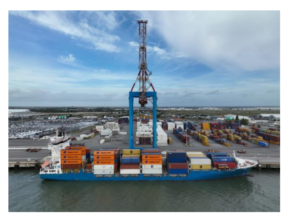
The first call by the WEC Lines shipping service, on 19<sup>th</sup> September 2023, at Montoir de Bretagne.

Nantes – Saint Nazaire Port contributed to the development of new shipping services in 2023. The Port Authority also made a number of investments in order to maintain and to develop the level of performance of its industrial facilities, to the benefit of the Regional Community's businesses.