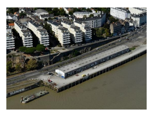
The site of Shed 12, Quai d'Aiguillon, is forming the subject of a real-estate development project.

Nantes – Saint Nazaire Port is seeking to breathe new life into old port facilities located in the heart of the City. In this way, the Quai d'Aiguillon – Shed N° 12 site beside the River Loire, halfway between the rapidly changing Bas-Chantenay District of the City and the heart of Nantes, has formed the subject of a call for expressions of interest. Shed N° 12 will make way for a new building, which will be exemplary on an environmental level, and which will contribute to the economic development of Bas-Chantenay and help to make the most of the Port Authority's real estate.