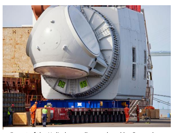
Export of the Haliade nacelles produced by General Electric, outbound from the dedicated facility at Montoir de Bretagne.

Ro-ro activities have regained good momentum after the years of COVID-19-related disruption, thereby strengthening Montoir de Bretagne's position as the chosen point of entry for flows of motor vehicles arriving from Morocco and Spain. Furthermore, since June 2023, the terminal has been utilized for the export of the 13-MW Haliade X offshore wind turbine nacelles assembled at the General Electric factory, which is located close to the berth where such XXL cargo handling operations are carried out. 35 generators have been transported to offshore wind farm facilities in the United Kingdom and 21 to the USA.