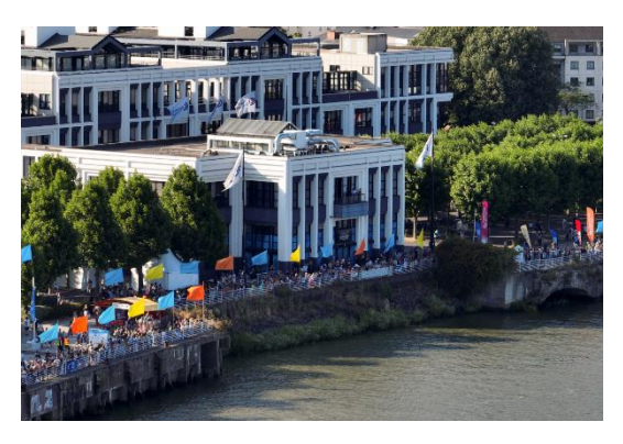
Nantes – Saint Nazaire Port was a partner of the "Right on the Loire" event.

Nantes – Saint Nazaire Port is stepping up its efforts to become better known to the general public, and notably to the citizens of the Loire Estuary. From 30<sup>th</sup> May to 5<sup>th</sup> June, the festive, nautical and cultural event "Right on the Loire" returned for a third edition, which attracted 200 000 spectators between Saint Nazaire and Mauves-sur-Loire. The guiding theme of the festival was the spotlight cast on the Estuary and the strong bond that unites the inhabitants and their river. A major partner of the event, Nantes – Saint Nazaire Port welcomed the participants (including the organizers and their partners) and a large audience to its facilities, notably to the Quai d'Aiguillon quay, which