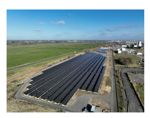
Sited to the east and to the north of the LNG terminal, the photovoltaic power plant operated by Engie Green.

Furthermore, a second project driven by energy specialist Amarenco and covering an area of 13.9 hectares to the west of the LNG terminal is currently undergoing administrative review.