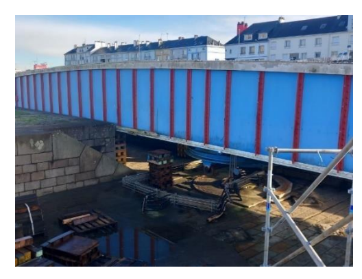
Refurbishment work on the swing bridge of the south lock, in Saint Nazaire.

In Saint Nazaire, the mobile structures permitting access to the dock basin have benefitted from an extensive upgrade over the course of several years, and are under constant scrutiny to ensure that they are ready to meet the major challenges ahead, an intense level of dockyard activity being concomitant with the deployment of offshore wind farms. Refurbishment work has been carried out at the location of the south lock, notably on the downstream part of the structure and on the swing bridge, including the hydraulic and electric mechanisms.