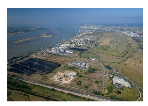
A 12-hectare site located to the north of the multi-bulk terminal will accommodate a renewable hydrogen production facility.

Hydrogen is already benefitting from strong momentum, driven by the national strategy for the development of low-carbon hydrogen in France, and as will offshore wind power, this energy source will be called upon to occupy an increasingly important place in the French and European energy mix. Aware of the potential of this new energy source, Nantes – Saint Nazaire Port has been studying the scenarios for the deployment of the hydrogen sector within its ecosystem, with the ambition of becoming the first major port facility for hydrogen on France's Atlantic Seaboard.