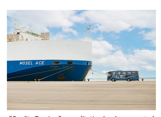
"Quality Tourism" accreditation has been granted once again for the tours of the downriver port facilities.

Invested for almost 20 years now in business discovery tourism, Nantes – Saint Nazaire Port collaborates with the Tourist Offices in Nantes and in Saint Nazaire (A Journey to Nantes and Stunning Saint Nazaire), as well as with the Regional Community's tourism amenities in welcoming nearly 20 000 visitors a year. The quality of the tours of the downriver port installations was recognized once again at the start of November, with the renewal of the Qualité Tourisme™ ("Quality Tourism") brand accreditation. Conducted by Stunning Saint Nazaire, these tours attract close to 2 000 people each year.