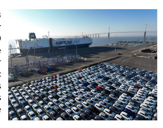
A call by the Neptune Horizon, on 11<sup>th</sup> February, with 3 100 vehicles on board.

The volume of activity at the ro-ro terminal progresses by 13 %, as a result of a strong upturn in the automotive sector after the difficult years that followed on from the COVID-19 pandemic. In 2023, over 118 000 vehicles transited the terminal, which has become the preferred point of entry for deliveries from Morocco and Spain. In addition to the historic shipping lines LD Seaplane and Suardiaz, new operators such as Grimaldi, Neptune Lines, Transfennica, Erkport and Polaris have been calling at Montoir de Bretagne. Furthermore, the Stellantis plant in Rennes has chosen the Loire Estuary facilities as the port of shipment for its vehicles bound for Turkey, and automobile manufacturer Volkswagen has used those same installations on several occasions to supply its inter-regional network of dealerships.