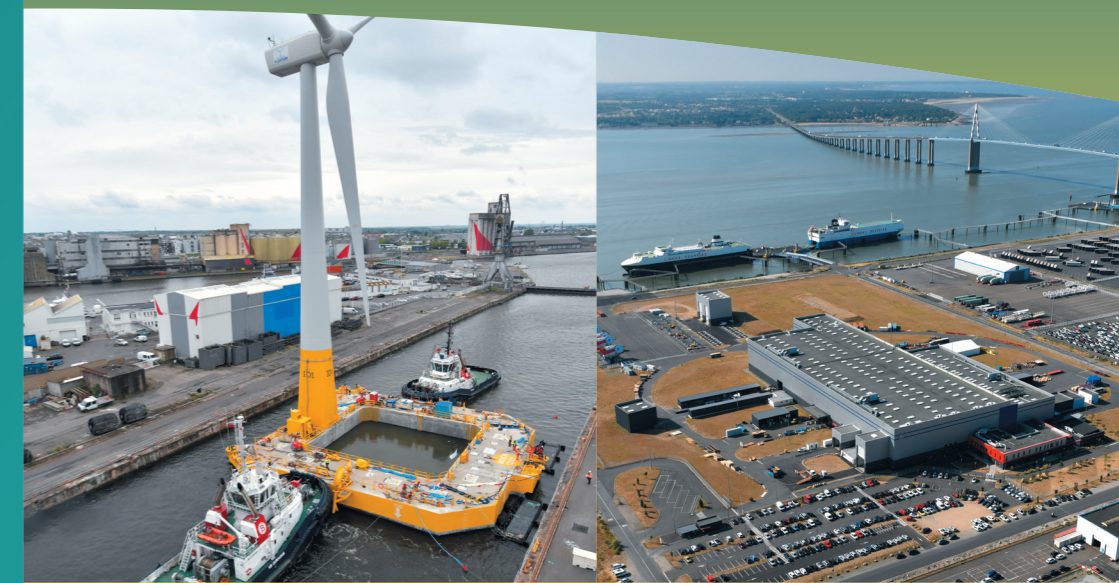
The Floatgen floating wind turbine, during an operation in the Joubert sluice dock.