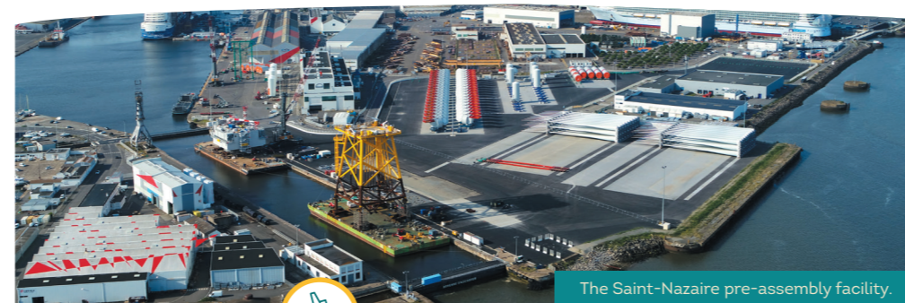
The Saint-Nazaire pre-assembly facility.