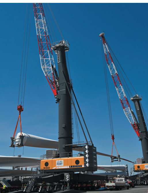
Unloading of wind turbine blades using port cranes in tandem.

An ecosystem of port players on hand: • Centres for competitiveness and an MRE cluster (Neopolia); • Maritime professionals working to ensure safe, reliable in-port reception; • High-added-valued solutions for all shipbuilding or ship repair work.